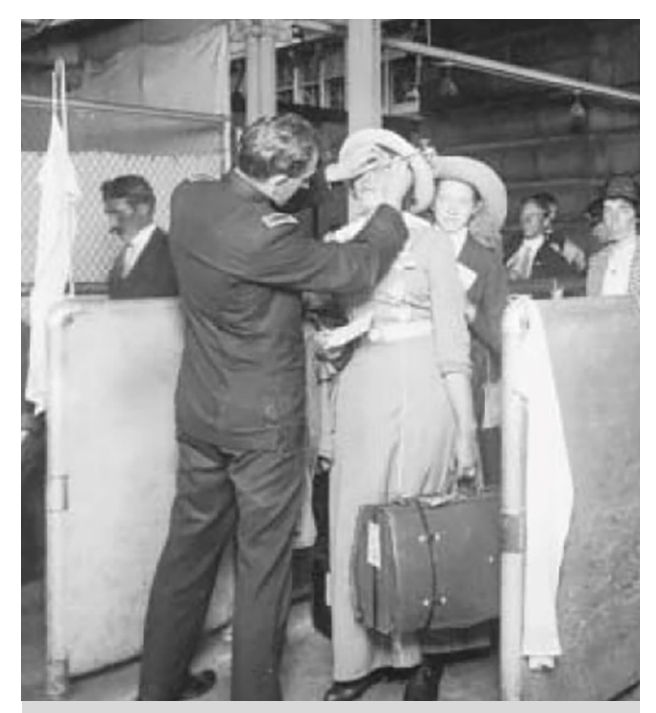
In the 1900s, immigrants to the US were examined for signs of trachoma when they arrived at Ellis Island.

Throughout the 19<sup>th</sup> century, the spread of trachoma was often caused by soldiers travelling to fight in the war. In the 20<sup>th</sup> century, it started to spread through mass movements of a different kind: migration.