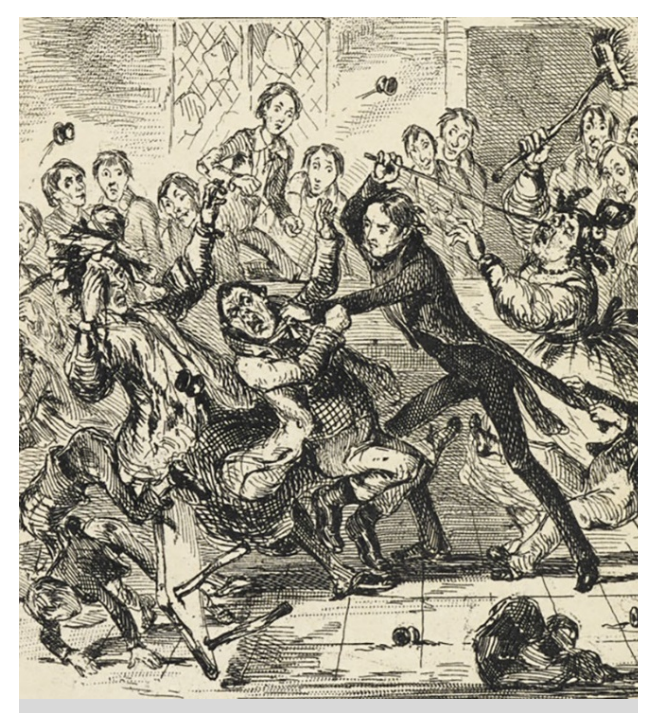
An illustration from 'The Life and Adventures of Nicholas Nickleby', which was thought to have been inspired by real-life cases of trachoma.