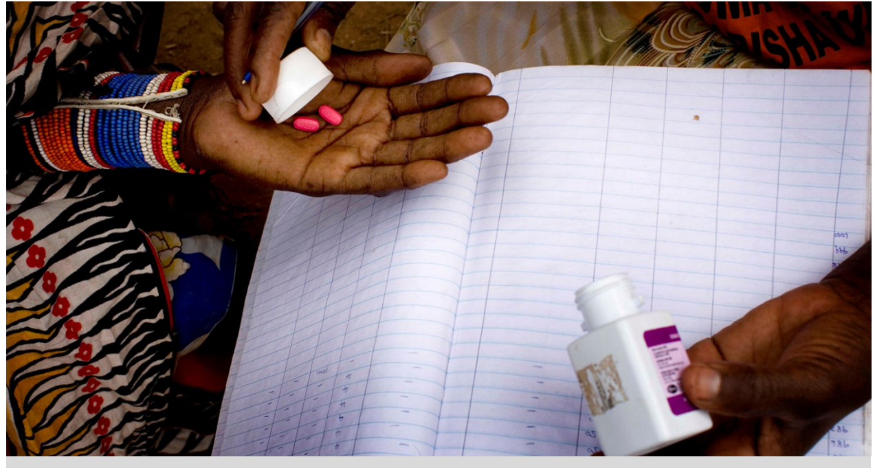
Zithromax® was first tested in 1993 to treat trachoma, and is now the most common treatment.