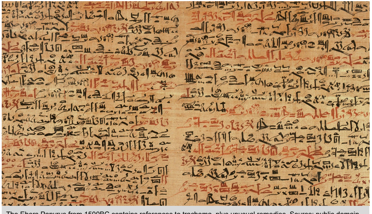
The Ebers Papyrus from 1500BC contains references to trachoma, plus unusual remedies.

Echoes of trachoma can be found in ancient Greece and Rome. The Hippocratic Corpus, a collection of medical records from the 5<sup>th</sup> century BC, contains sections on trachoma, as do plays from Aristophanes, such as his ancient Greek comedy 'Plutus'. The first suggestions that trachoma was infectious are thought to have been made by Plato.<sup>5</sup>