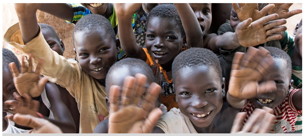
In 2018, trachoma was officially eliminated in Ghana, paving the way for other countries to follow.

The End is in Sight is Sightsavers' campaign to eliminate trachoma by 2025. To learn how you can help us make history, visit <a href="https://www.sightsavers.org/EndIsInSight">www.sightsavers.org/EndIsInSight</a>